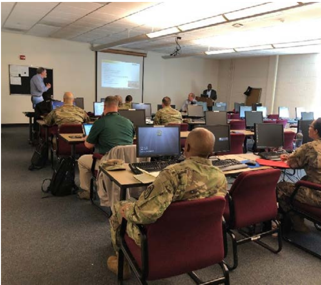
DCARNG members participated in D120 Deployment Readiness Coordination Event on Feb. 5 and 6.

BY ROSIE STAHL, INTEGRATED PERSONNEL AND PAY SYSTEM – ARMY