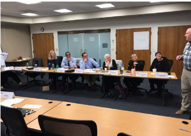
P2E staff and leaders participated in an off-site professional development meeting, Feb. 5 and 6, 2019.