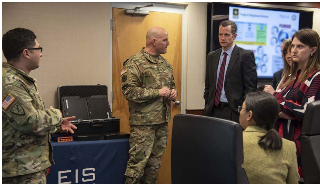
Professional staff members of the House Appropriations Committee - Defense visited PEO EIS Feb. 27, 2019.