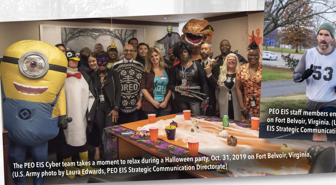
The PEO EIS Cyber team takes a moment to relax during a Halloween party, Oct. 31, 2019 on Fort Belvoir, Virginia.