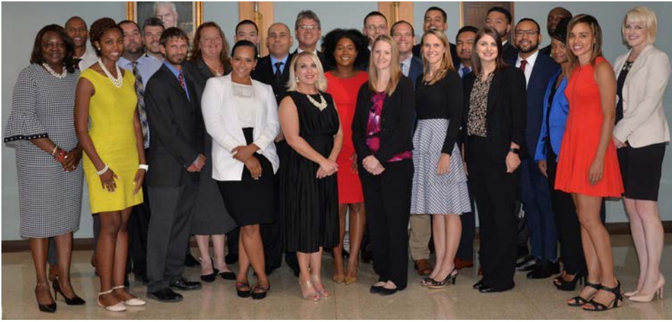
Graduates of the 2019 Emerging Enterprise Leaders (EEL) program completed a year-long course to foster leadership skills in members of the Army Acquisition Corps.

fulfilled requirements passed down from the "Big Army." The Emerging Enterprise Leaders (EEL) program he attended, however, allowed him to flip the script.