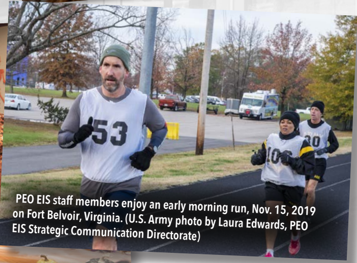
PEO EIS staff members enjoy an early morning run, Nov. 15, 2019 on Fort Belvoir, Virginia.