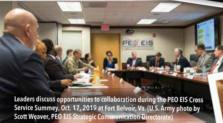
Leaders discuss opportunities to collaboration during the PEO EIS Cross Service Summit, Oct. 17, 2019 at Fort Belvoir, Va.