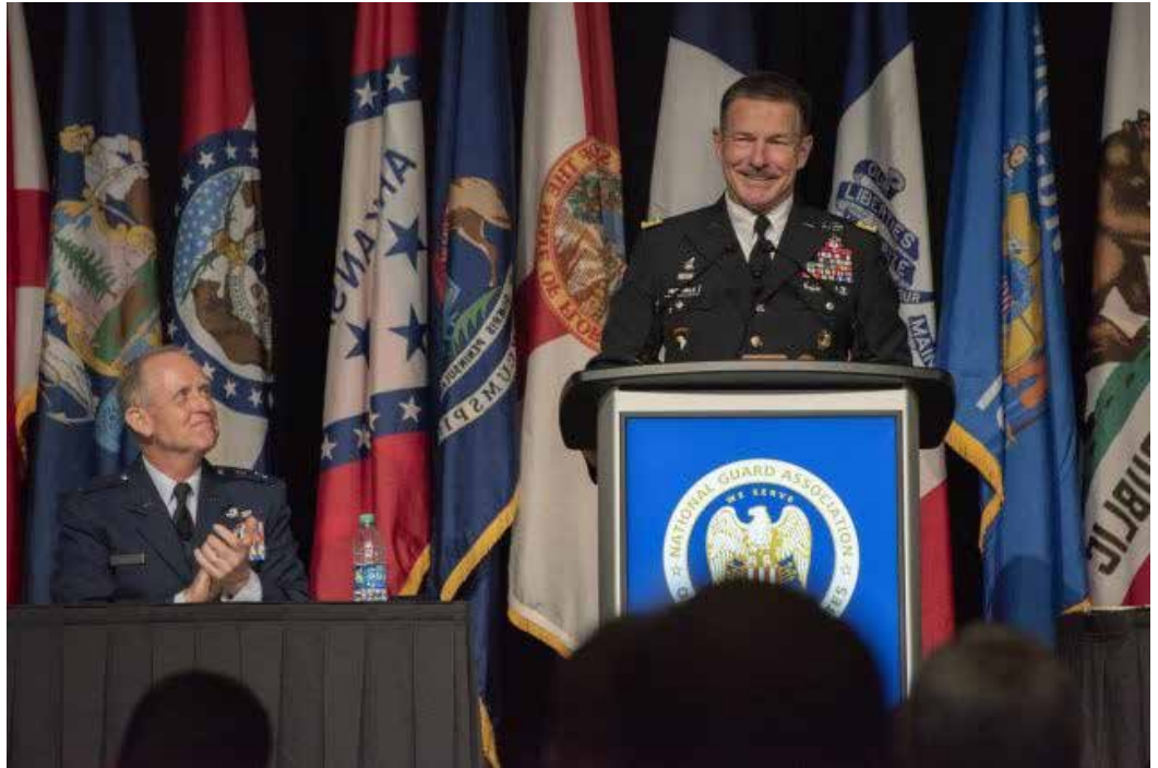
Gen. James McConville, chief of staff of the Army, speaks during the annual conference for the National Guard Association of the United States in Denver Aug. 31, 2019. McConville touted the work of National Guard Soldiers and said the Army plans to take advantage of the skillsets many citizen Soldiers possess.

IPPS-A allows leaders to better manage talent and assign jobs that match Army requirements to Soldier knowledge, skills and behaviors. It even logs a Soldier's preferences, such as if he or she has a desire to stay in one location longer.